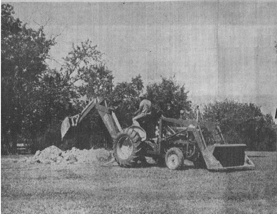
Ground being broken this week for the clubhouse of the Salem golf club. The fifth tee, on the southeast corner of the course was chosen as the site for the clubhouse.