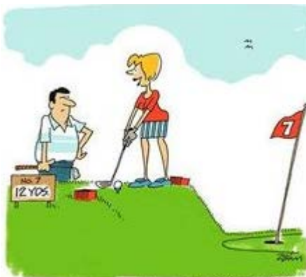
"I love the women's tees on this course!"