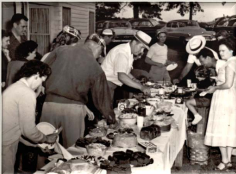
REMEMBER WHEN PHOTO OF A CLUB PICNIC. WOW, .....LOOK AT THAT SPREAD OF FOOD!

JOIN A GOLF LEAGUE, MAKE SOME NEW FRIENDS AND MOST OF ALL.....HAVE FUN !!!