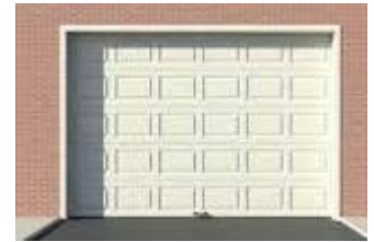
SHUT CART SHED DOORS